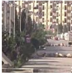
UPDATED Video: Insurgents Take Palace Of Justice, Layramoun