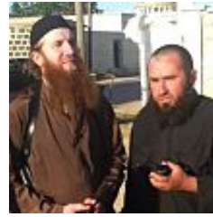
Syria: Umar al-Shishani of ISIS On Need For Unity, & Division of Spoils According to Rules of Jihad