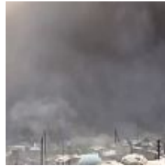
Syria April 28: Islamic Front Statement On Aleppo Tunnel Bombings