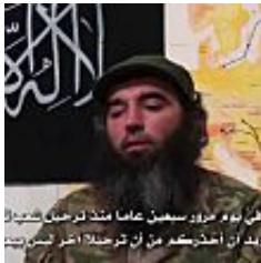
Krymsky To Crimean Tatars: Return To Islam & Jihad Or Face Mass Deportation