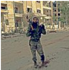
Sayfullakh's Jamaat Deny Dutch Fighter's Defection To ISIS