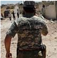
The Caucasus Emirate In Aleppo: At The Scene Of A Barrel Bomb Attack