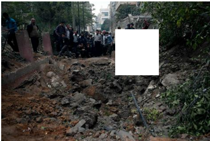
Residents gather at a site hit by what activists say was airstrike by forces loyal to Syria's President Bashar al-Assad, near a children's park in the Duma neighbourhood of Damascus November 27, 2013.