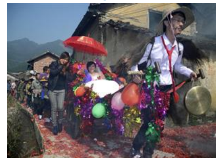
A selection of images from around the world- Tuesday, November 26, 2013.